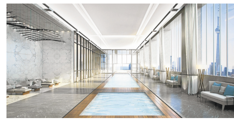
Indoor and outdoor salt- and freshwater pools are planned for the space.

"We've also got some empty nesters and young professionals so it's across the spectrum of this market," added Schiff.